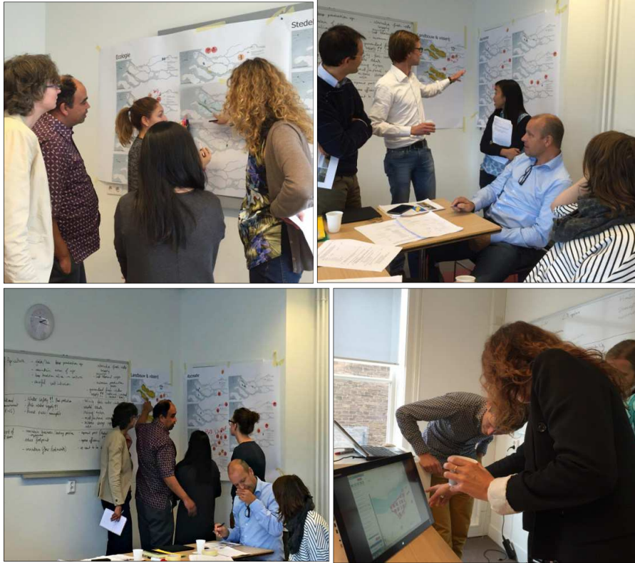
Image 3: discussion around intervention maps for developing a shared vision

Each group later presented their comprehensive visions to others where the facilitator asked groups for consent. The disagreeing groups had to explain the reasons to others which initiated further discussions.